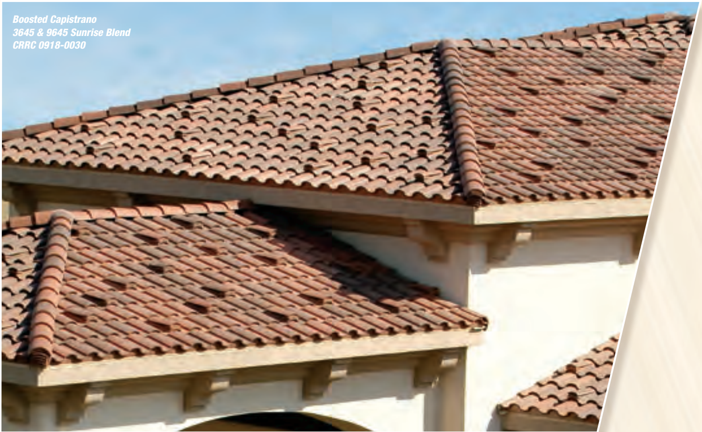
Boosted Capistrano 3645 & 9645 Sunrise Blend CRRC 0918-0030

Eagle Roofing Products offers products and services that may help a project qualify for LEED®, GreenPoint Rated, NAHB Model Green Home Building Guidelines and other green building programs*. See below for detailed information about products and programs.