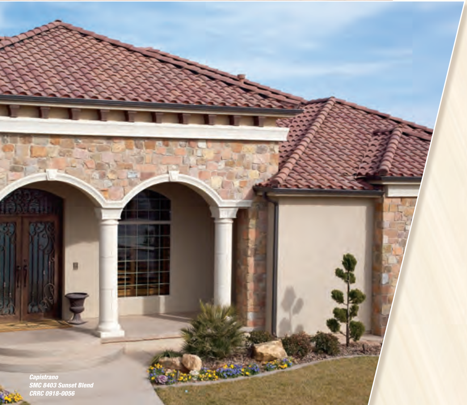
Capistrano SMC 8403 Sunset Blend CRRC 0918-0056