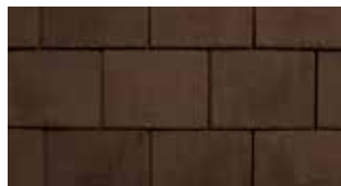
EuroLite Slate® Rustic Brown

(Colours may not appear exactly as shown)