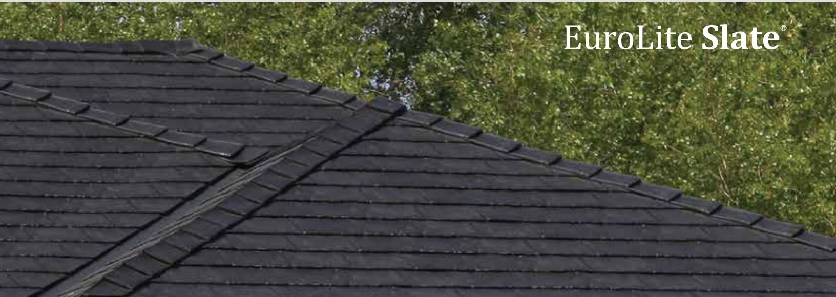
EuroLite Slate ®