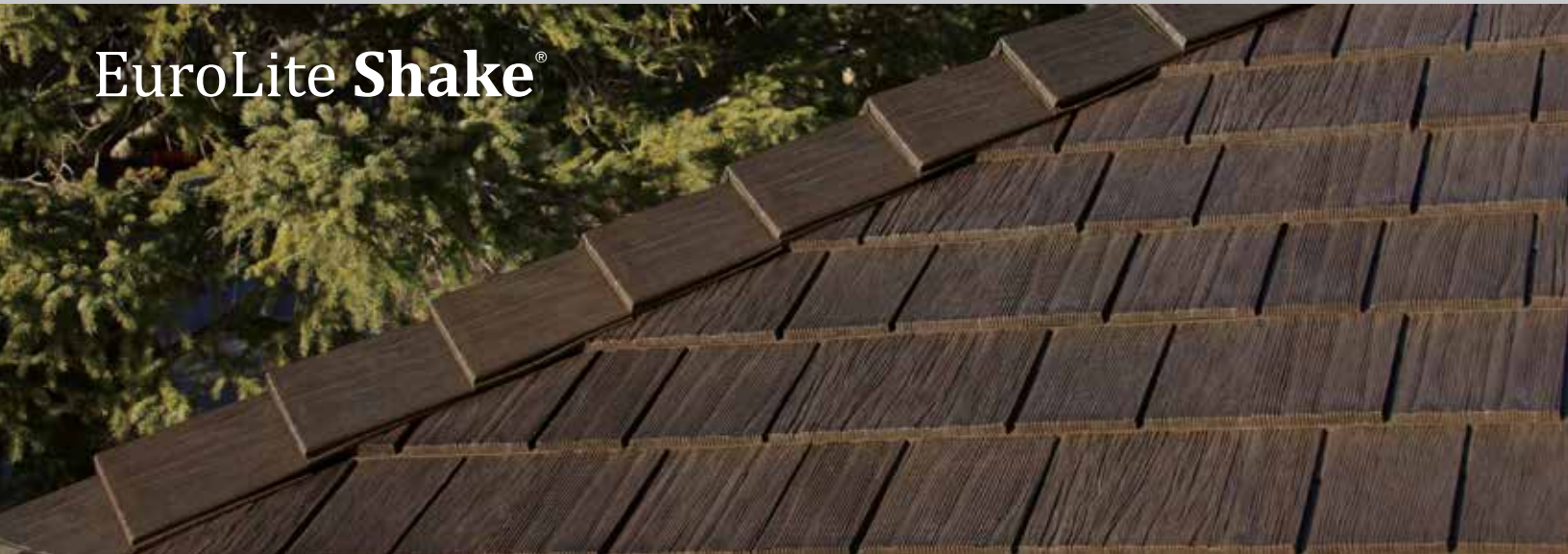
EuroLite Shake ®

“Premium Look, Quality and Performance...Without the Premium Price”