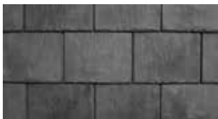
EuroLite Slate® Sterling Grey