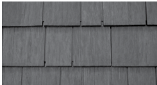
EuroLite Shake® Silverwood Grey