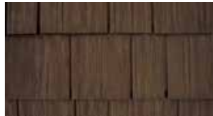
EuroLite Shake® Woodlands Brown